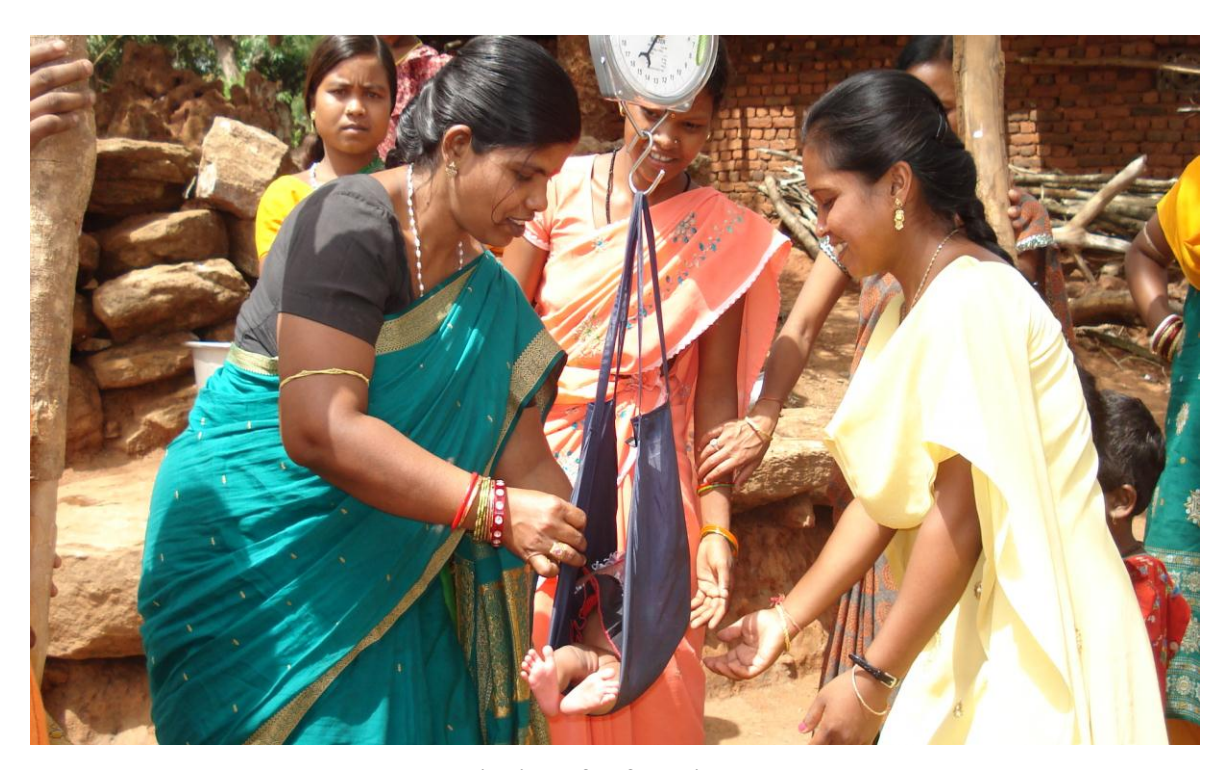
Weighing of Infants in Progress

other locations staff continued to work on malaria prevention, monitoring immunisation and child care at the Anganwadis. This year 216 orientation meetings, 17 adolescent screenings, facilitating 318 institutional deliveries, attending 324 VHND sessions, immunization of 1229 women/children etc., has also been done.