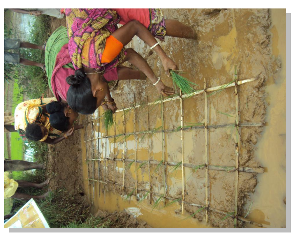
TRAINING ON SRI PADDY CULTIVATION TO WOMEN FARMERS