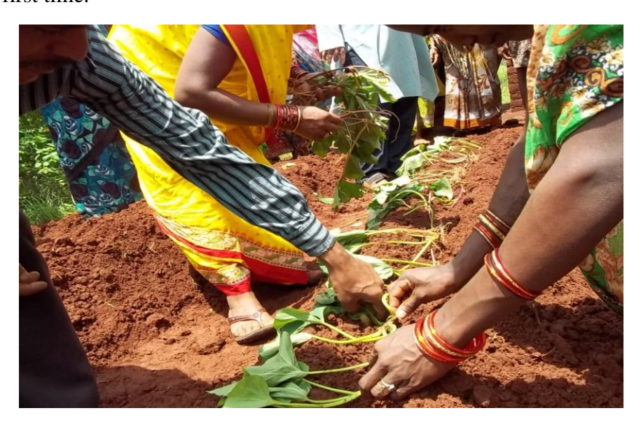
ORANGE SWEET FLESHED POTATO PLANTATION TRAINING

Around 203 farmers of 15 villages regenerated traditional seeds in their cropping for first time.