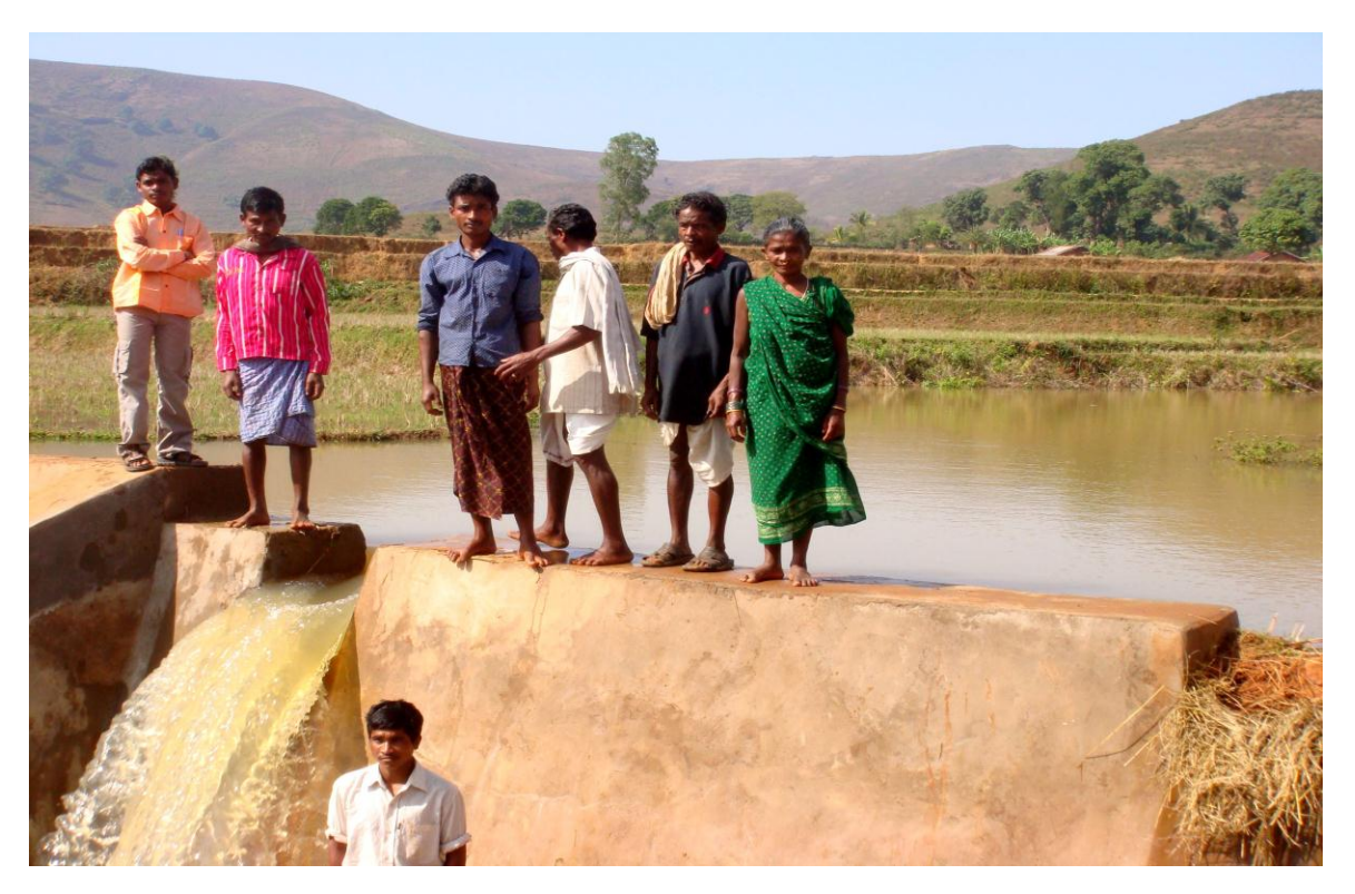
Checkdam construction under MGNREGA